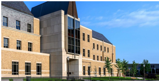
Mendoza College of Business