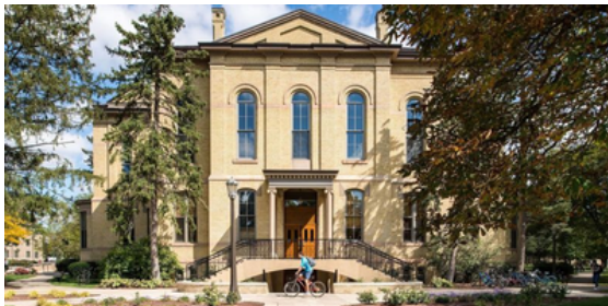
LaFortune Student Center