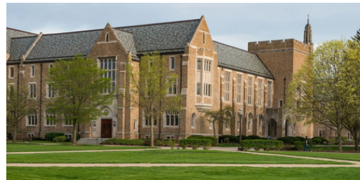
Biolchini Hall of Law (Notre Dame Law School)